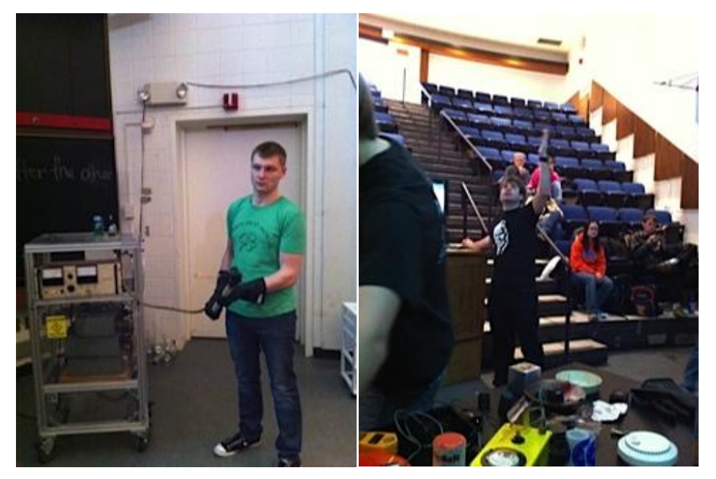
Engineering Open House Demonstrations

We were also very fortunate to win an award this year for our EOH efforts. Engineering Council, our schools student run council that governs engineering organizations, awarded ANS UIUC and NPRE the Spirit of Illini Engineering Award. We are the fourth department to win this award since its inception.