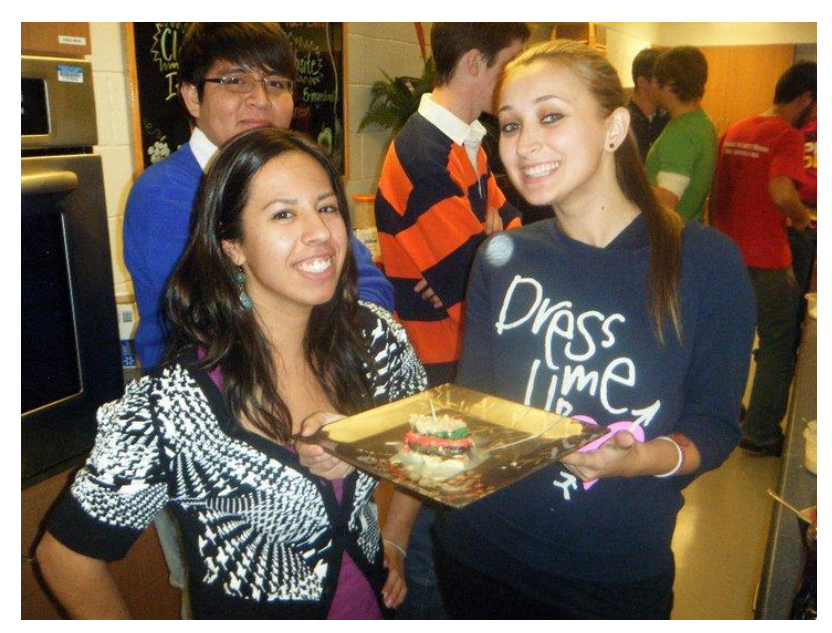
Pancake Cook Off!

The pancake cook off was a new and unique event this year. We pitted teams of two students against each other in a head to head pancake cook off. Each team was given seven minutes to make their pancake with taste, originality and teamwork being judged. Some of the funnier pancakes are shown below.