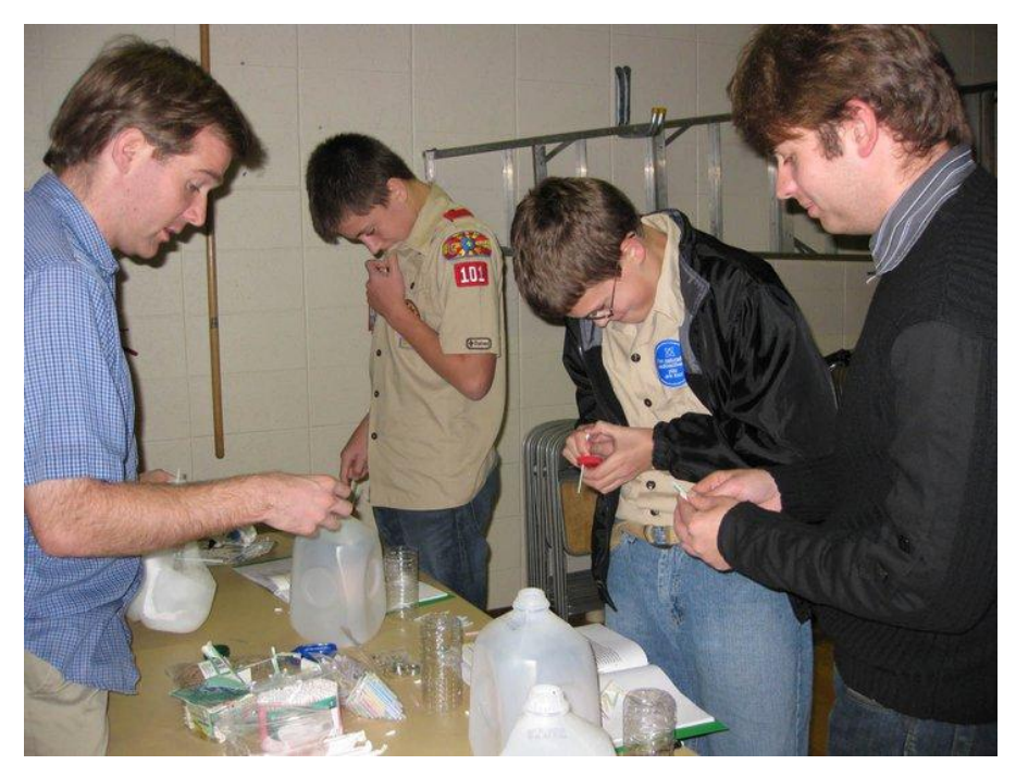
Our fall merit badge.