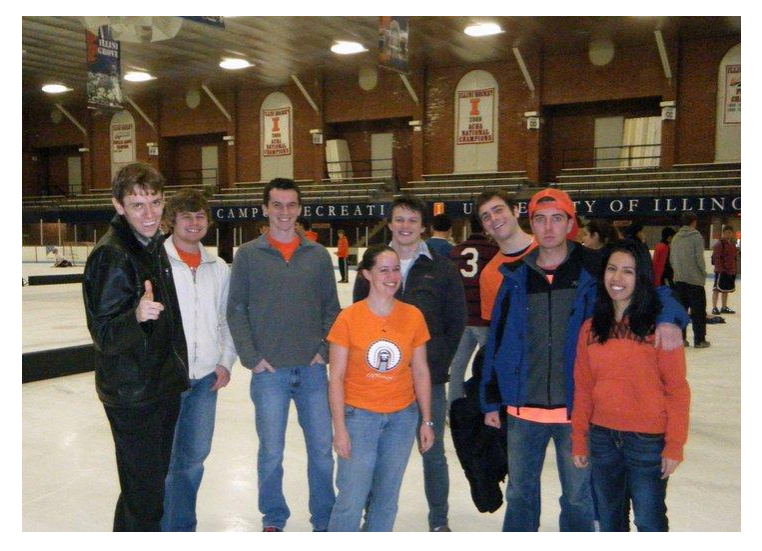
The awesome broomball team.

A longstanding tradition of ANS UIUC is to field a broomball team. Broomball is a sport similar to hockey, but it is played with shoes instead of skates on the ice. This year our team unfortunately lost in the first round of the tournament, but it was very fun nevertheless.