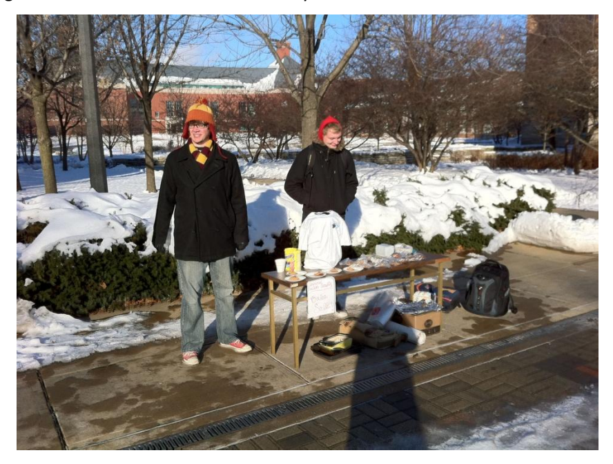
Our Relay for Life Bake Sale in the freezing cold.

This year we tried a new event in the form of a Bake Sale. We asked members to bake goods and then proceeded to sell them on the Engineering Quad on what I would argue was the coldest day of winter. We raised a little over 100 dollars and donated 200 dollars to Relay for Life, a cancer awareness and research organization. Our best seller of the day was fresh hot cocoa.